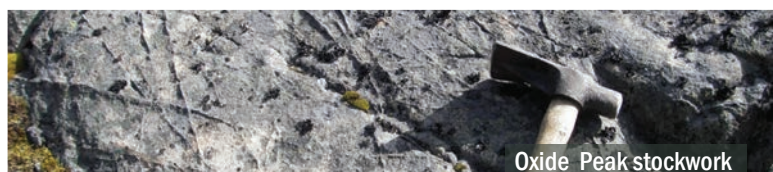
Oxide Peak stockwork